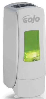
GOJO ADX-7 8780-06

Performance Guaranteed LTX and ADX systems carry the GOJO Lifetime Performance Guarantee – a dependability promise that even includes the LTX batteries.