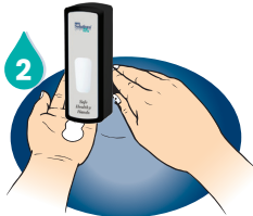
Apply enough soap to cover entire surface of hands