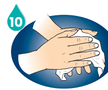
Pat hands dry with paper towel