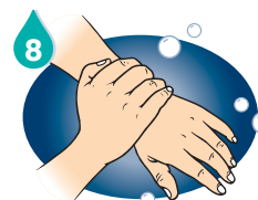
Wash each wrist