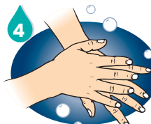
Wash back of each hand with palm of opposite hand