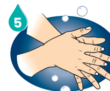
Wash between fingers