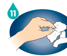
Use paper towel to turn off the faucet