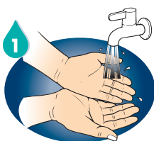
Wet hands with water