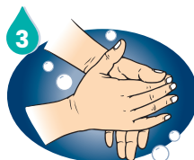
Lather soap and rub palm to palm