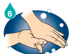
Wash each thumb