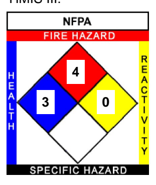
Health = 3, Fire = 4, Reactivity = 0 H3/F4/PH0