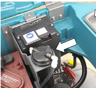
T300/e, Speed Scrub 300, A300