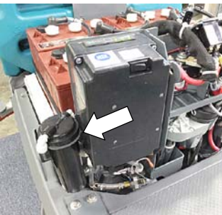
T7, Speed Scrub Rider