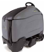
CHARIOT™ 3 IEXTRACT 26 DUO