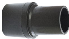
Hoses & Ends