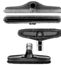
Smooth Surface Tools