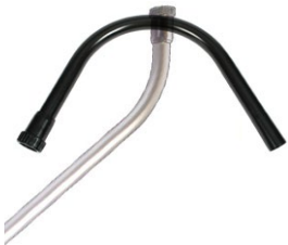
Wands (Various Shapes & Lengths)