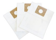
Filters & Bags