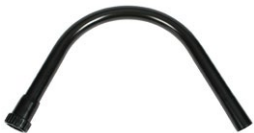
Wands (Various Shapes & Lengths)