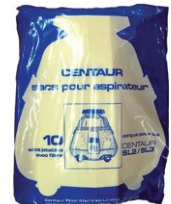
Filters & Bags