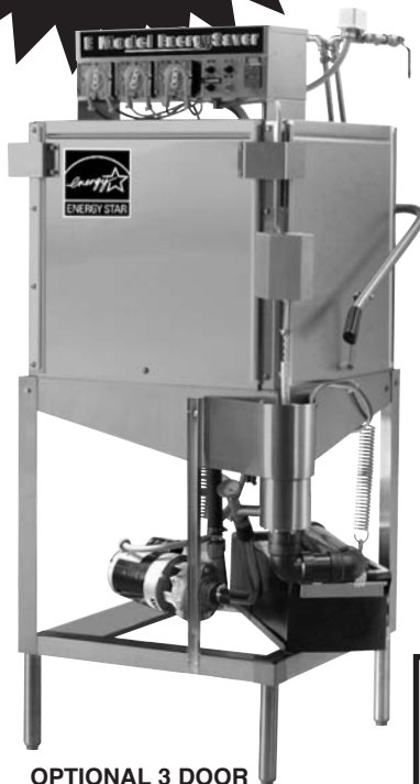
OPTIONAL 3 DOOR MODEL AVAILABLE FOR STRAIGHT AND CORNER OPERATION