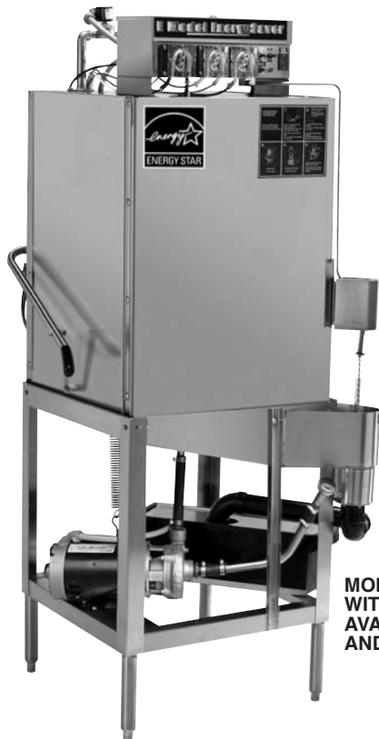
MODEL E EXT WITH 20-1/2" DOOR OPENING AVAILABLE IN STRAIGHT AND CORNER MODEL