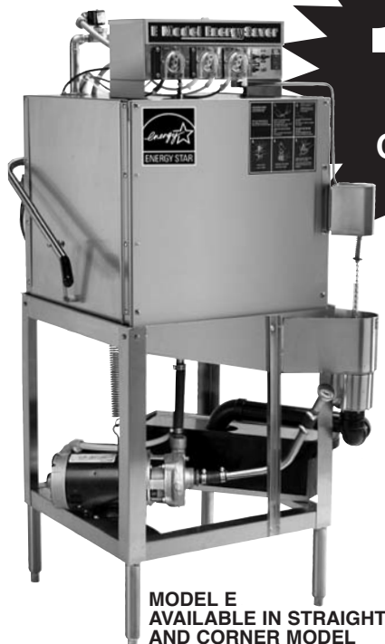
MODEL E AVAILABLE IN STRAIGHT AND CORNER MODEL

USES ONLY 1.01 Gallons Of Water Per Cycle!